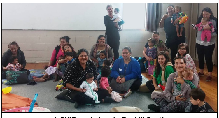
A SKIP workshop in Roskill South