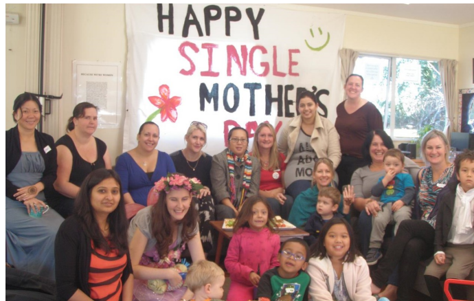
SKIP Single Mums' Mother's Day 2013

The SKIP Single Mums' Mother's Day attracted single mum families who needed to come together on that day because there was no other adult in the family facilitating the appreciation and celebration of mum's role.