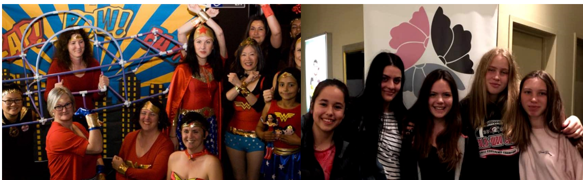
Left: At our screening of Wonderwoman. Right: Fabulous to see members of the Mt Albert Grammar Feminist Club at our screening of Battle of the Sexes.

Thank you to every single one of you who has contributed to the Centre in 2017 - it makes a huge difference! Our fundraising focuses on growing support for women's equality and our Centre, and on building relationships with our supporters, while improving our financial sustainability.